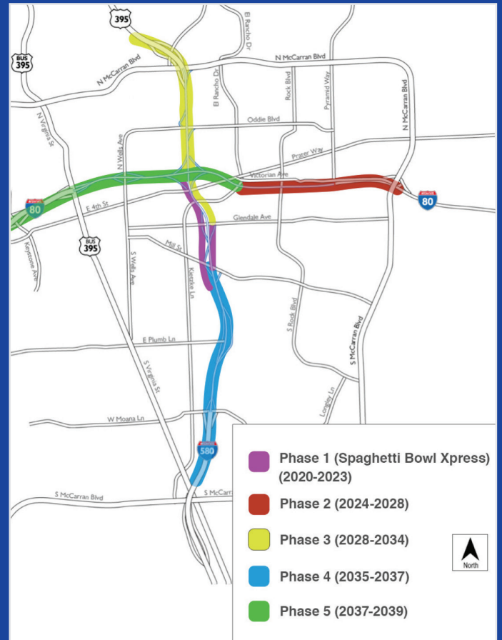
*Information is preliminary and subject to change.